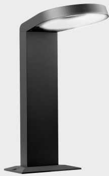
mike floor K60.7000.01.FL.DG-DG.ST.8.30