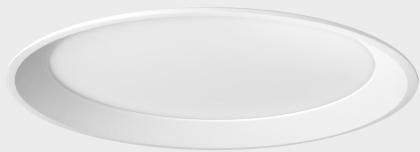
lim miranda K53100.02.RF.WH-WH.OP.ST.8.40.DA