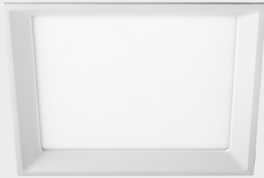
lim miranda sq K53105.02.RF.WH-WH.OP.ST.8.40.DA