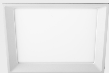
lim miranda sq K53105.02.RF.WH-WH.OP.ST.8.30.PU