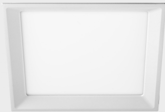
lim miranda sq K53105.01.RF.WH-WH.OP.ST.8.30.PC