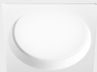
lim sq K50321.02.RF.WH-WH.MP.ST.8.30.D1